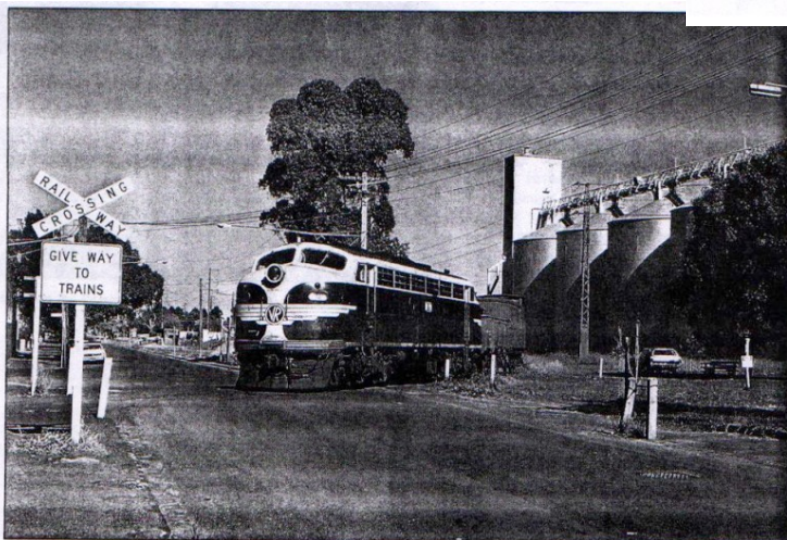
Having departed North Fitzroy, B79 crosses Park Street with a short train destined for Fitzroy Goods. Unseen behind the locomotive is an employee protecting the level crossing with a red flag. 23.12.80.