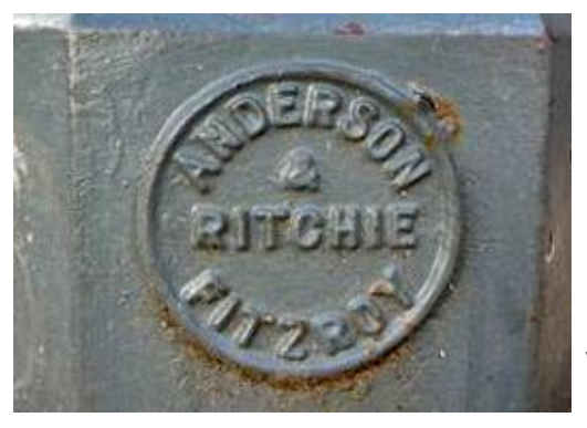
Base of lamp-post with manufacturers' name

Lamplighters' Wages .-- Recommended -That the rate of wages of the four lamplighters other than the foreman, be increased from twenty shillings to twenty-two shillings and sixpence per