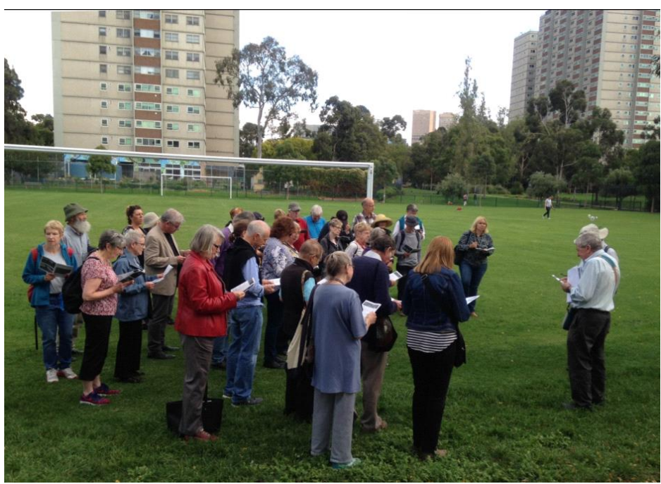
Walk participants on the Atherton Reserve near the corner of Charles and Napier Streets.

The walk then finished back at the Town Hall and a smaller group then walked north along Napier St, using a 1920 photo taken from the Town Hall tower as reference material. Turning east along Greeves Street, several finished with drinks and jaffles at the Bad Frankie bar, to conclude a very pleasant and informative afternoon.