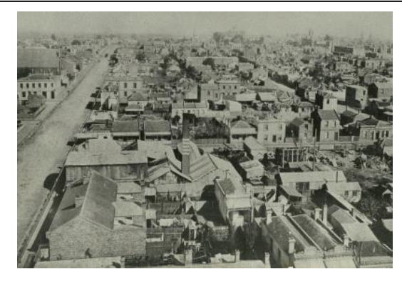
Title: View south from the Fitzroy Town Hall tower, c1880, [Fitzroy Local History Photograph Collection, FL 1561]

The event is advertised on the National Trust website at: https://www.nationaltrust.org.au/ahf_event/remembering-fitzroy/