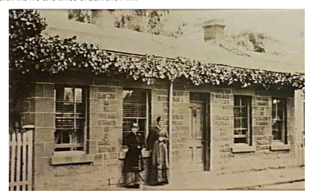
20 Leicester St. Photograph taken about 1878.