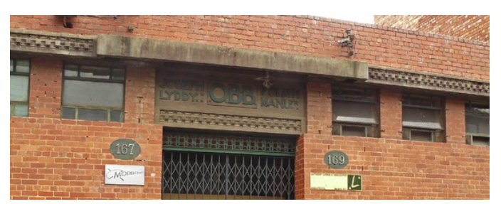
(This photograph, shows the decorative projecting cornice of pressed cement with a square crystalline pattern, repeated over the entrance (O.B.B. above the door stands for Oily, Black and Brilliant –the product manufactured in the factory)

Another highlight was the distinctive former Avon Butter Factory, built in 1932, (photograph below) whose original factory, offices and shop building remain intact. Designed by I G Anderson, this building is of cream brick with a 'Romanesque' tower, elaborate multicoloured and textured brick details, 'sunburst' edging, star patterns, corbelled eaves, Cordova roof tiles and wrought iron grilles. The pointed arch shopfront has inventive finned timber framing.