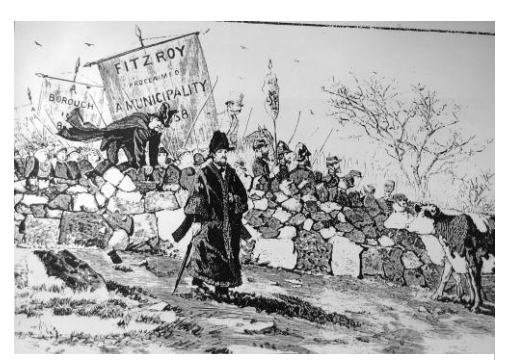
Beating the Fitzroy boundaries in 1882