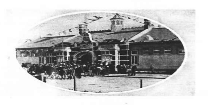
Opening of the Pool in 1908 - from the Fitzroy Library photo collection

Come Celebrate the Fitzroy Swimming Pool's 100th Birthday with a Family Fun Day