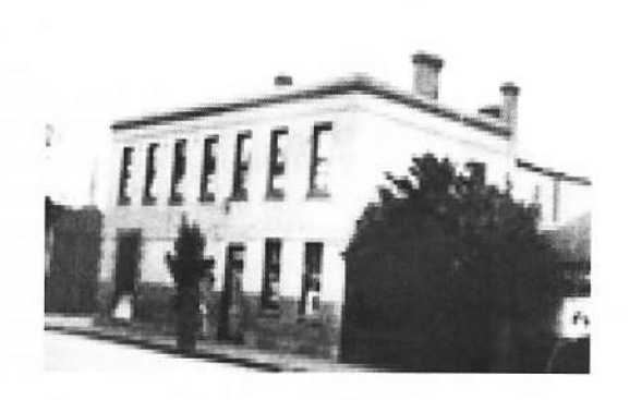
Royal Exchange Hotel