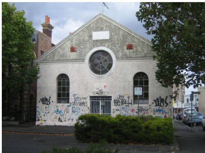
Former Gore Street Church of Christ

We look forward to a return visit from the Newstead Historical Society when we can show them the sights of Fitzroy. T G