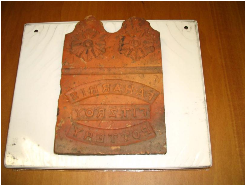
The F.A Harris Pottery Garden Edge