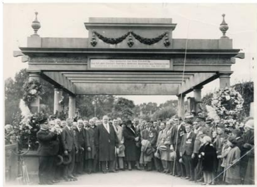
Anzac Day 1932, Edinburgh Gardens from The Argus , 26 April 1932

A walk to commemorate the Fitzroy volunteers who served and died in 1915