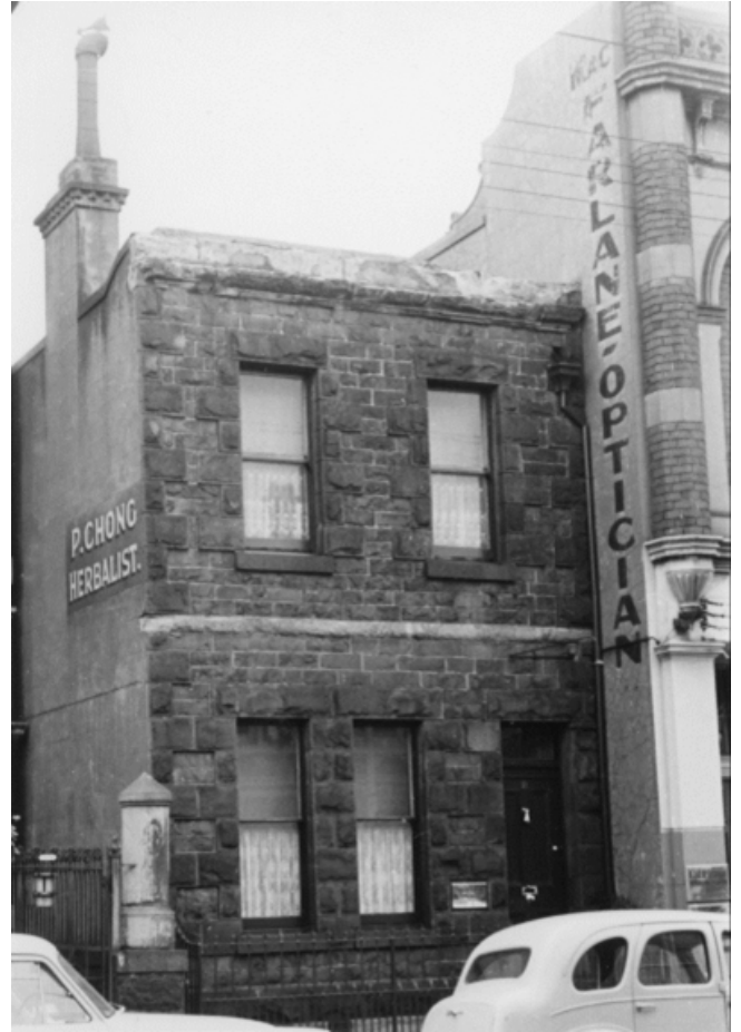
11 Gertrude Street - A two-storied building occupied by P. Chong Herbalist. c.1958.

The bluestone terrace is built of similar material as the Royal Terrace, with a bluestone facade with sandstone details. Bluestone was easily available from the quarries at East Brunswick and Clifton Hill. The two-storey house contains six rooms, with a small yard and