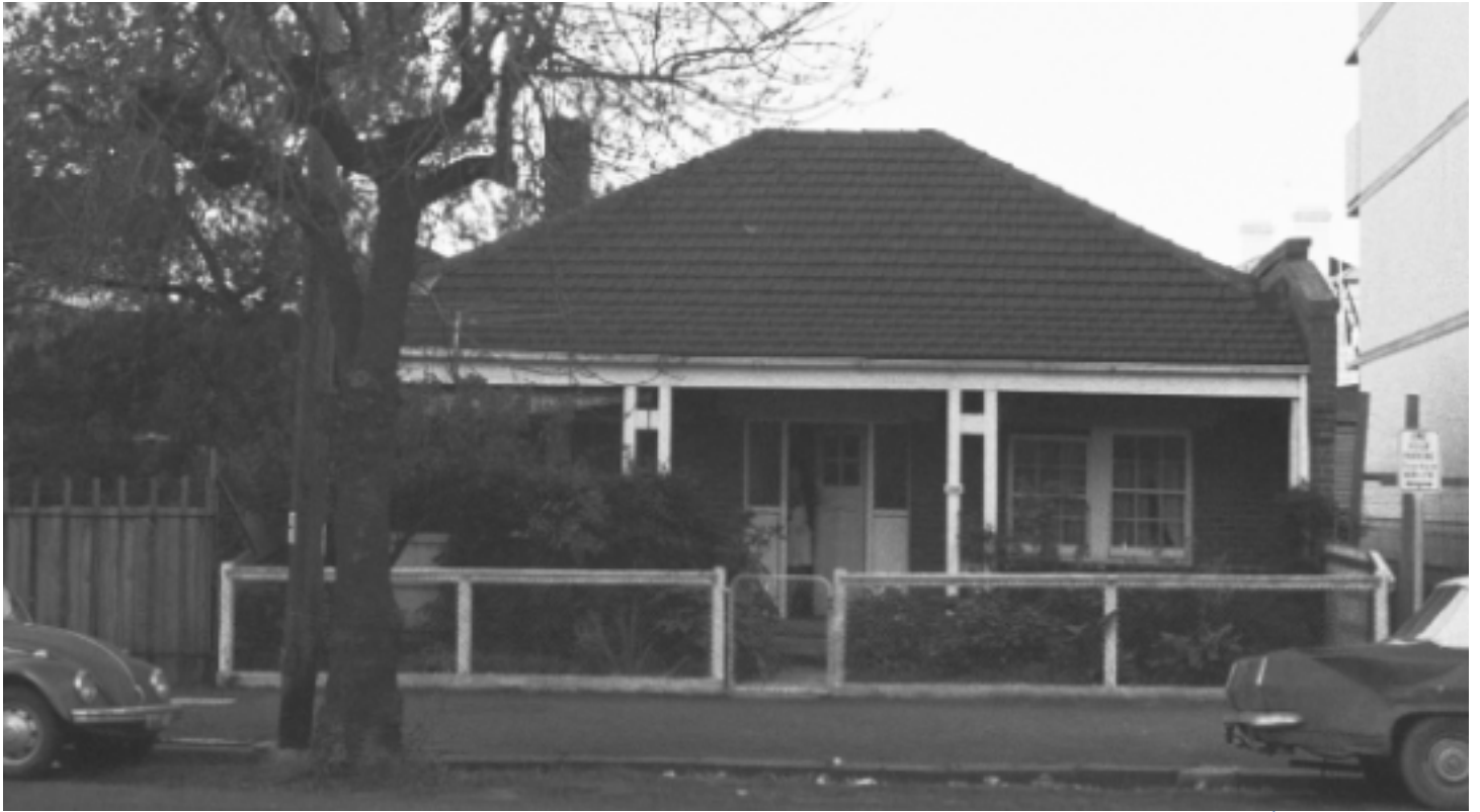
106 Napier Street, Fitzroy, State Library c. 1970-1974