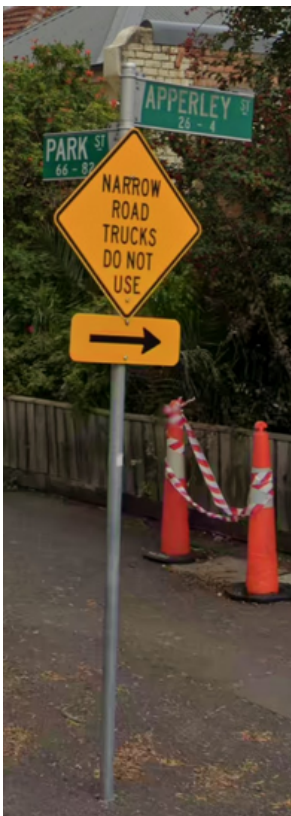
Street sign with incorrect spelling