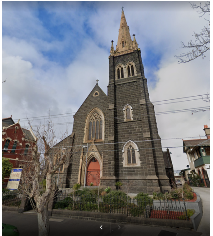
St John the Baptist Church

On 3 October the consecration will be commemorated by students from St. John's