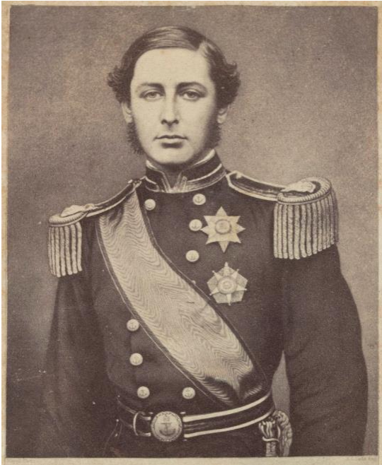
H.R.H. Prince Alfred, Duke of Edinburgh

Prince Alfred, the Duke of Edinburgh and second son of Queen Victoria visited Victoria over November-December 1867, travelling on his frigate HMS Galatea. The Fitzroy Council commemorated his visit by naming the Edinburgh Gardens and the adjacent Alfred Crescent.