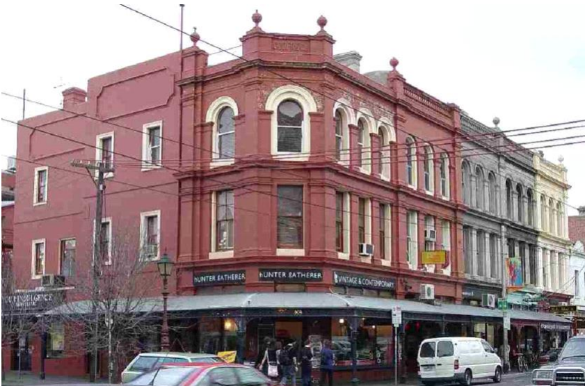
Godfrey 1 on the east side of Brunswick Street.