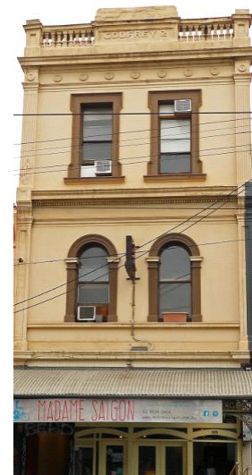
Godfrey 2 on the west side of Brunswick Street.

As shown by the newspaper and Sands & McDougall extracts below and on the following page, the buildings on the east side of Brunswick Street were built in 1887, while those on the west side were erected some time between 1890 and 1895.